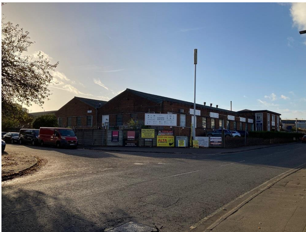
Western Parcel from junction of Colonial Way and Clive Way