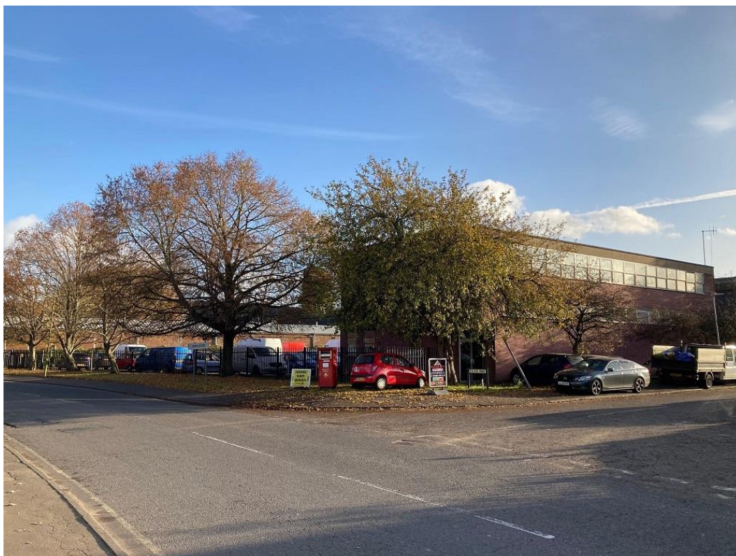
Eastern Parcel from junction of Colonial Way and Clive Way